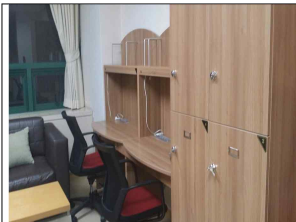
Desk, chair and locker